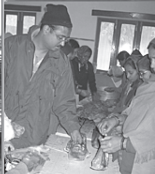
PACKING (POORI-HALWA) ON THE GO...