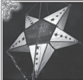
THE GLEAMING CHRISTMAS STAR