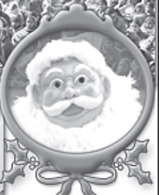
THE CHRISTMAS CHOIR (on the left) AND THE SANTA WISHING ALL A JOYOUS CHRISTMAS!

Jesus says, "...whoever wishes to be first among you must be slave of all." (Mark 10:44)