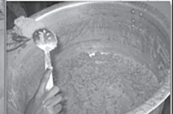
TAKING OUT THE DELICIOUS HALWA...