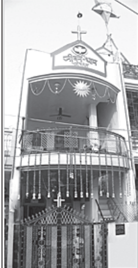
JEEVAN DHAM - ALL SET FOR CHRISTMAS